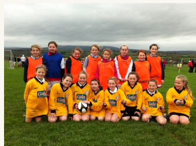
GLENVILLE NATIONAL SCHOOL PARTICIPANTS