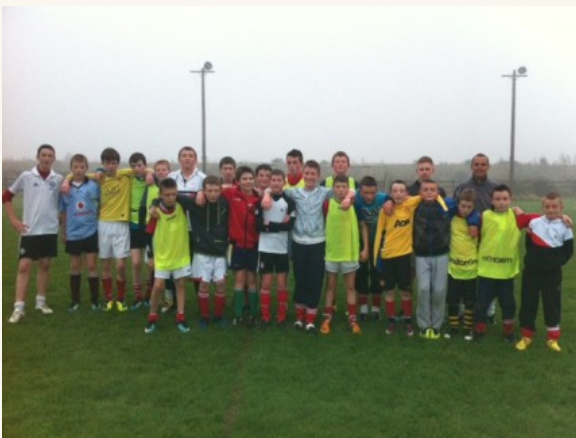
This season we've offered our club members the facility of "Concept Coaching", a technical and professional coaching programme for players of all ages and all abilities. The take up response has been fantastic, each Thursday at our club facilities in Watergrasshill.