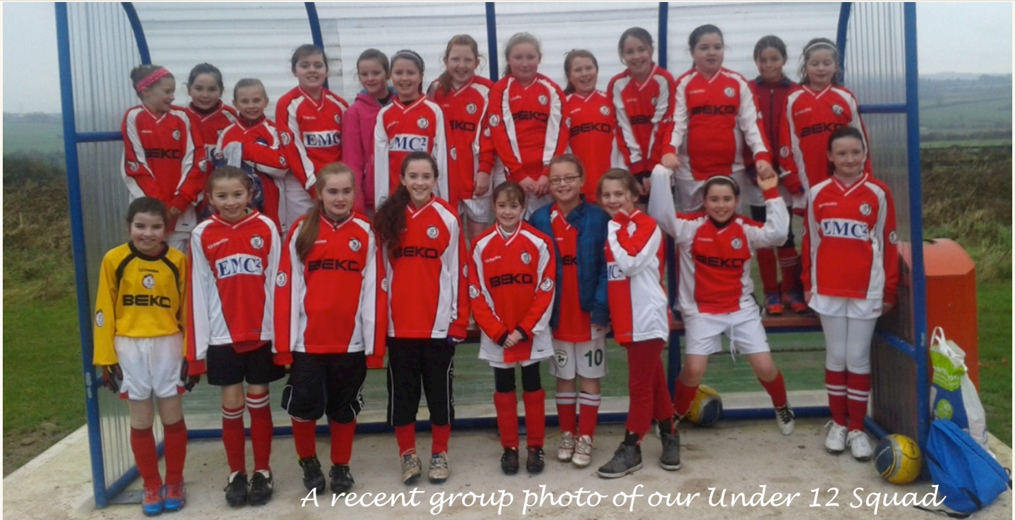
A recent group photo of our Under 12 Squad