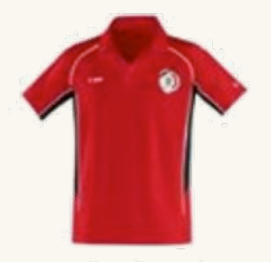
T-Shirts / Polo's

Our re-stocked Watergrasshill United Online Club Shop is available on <a href="http://watergrasshillunited.com/shop/">http://watergrasshillunited.com/shop/</a>. Have a look and order your favorite Watergrasshill United Crested Club gear.