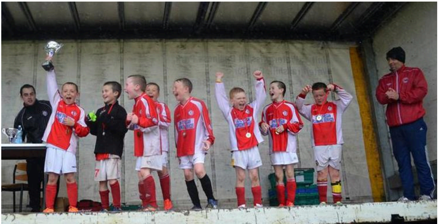
U9 Family Fun Tournament 2014/2015 winners Watergrasshill United U9's

Our third annual Family Fun Weekend Academy Tournament was a great success this year with over 300 kids taking part. U6, U7, U8, U9, U10 Teams from Watergrasshill United, Douglas Hall, Springfield Ramblers, Midleton, Mayfield, Ballinhassig, Corkbeg and Riverstown. The Watergrasshill U7's, U9's and U10's teams all secured a trophy as winners in their age groups. Ballinhassig secured the U6's trophy and Mayfield United won the U8's age group.